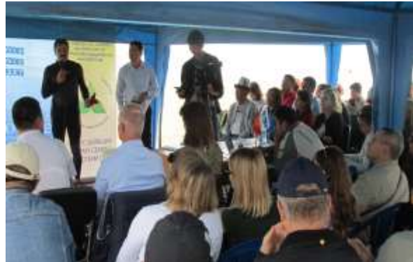
Activity 1.9 Training for judges and prosecutors on the Aarhus Convention are conducted in the Issyk-Kul region

August 3 in the boarding house "Kyrgyz seashore" in Bosteri of Issyk-Kul district hosted 6th training for the judiciary of Kyrgyzstan. This training led to the completion of the 2nd stage of training on justice issues on the principles of the Aarhus Convention. During 3 years Centre orginized trainings for representatives of human rights organizations, NGOs in the field of ecology, students of law faculties and judges of regional courts, Osh and Bishkek. In total, the fundamentals of the Aarhus Convention have been trained for more than 120