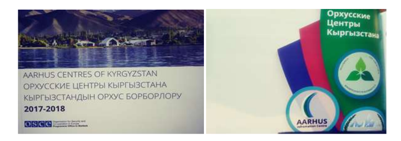
Activity 1.3 Information boards are produced and installed in four regions of Kyrgyzstan

In late September, in preparation of an international meeting of the Aarhus Centers of South-Eastern Europe, Caucasus and Central Asia, Aarhus Centre in Bishkek developed a bulletin of Aarhus Centres of Kyrgyzstan. Bulletin prepared with the help of the OSCE Programme Office in Bishkek, outlining the materials of the Centers for 2017 -2018 years. This collection was presented at the international meeting and distributed to all participants.