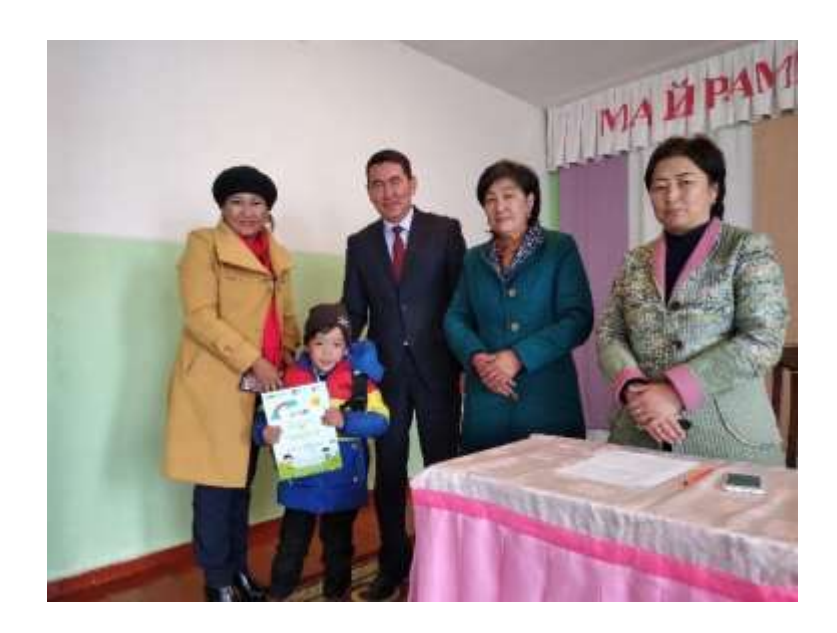
Activity 1.12 A study visit for the AC Issyk-Kul to Osh AC is organized

The winners were awarded valuable gifts and diplomas. The students who took an active part in the competition were also awarded letters of thanks from the Issyk-Kul Aarhus Center.