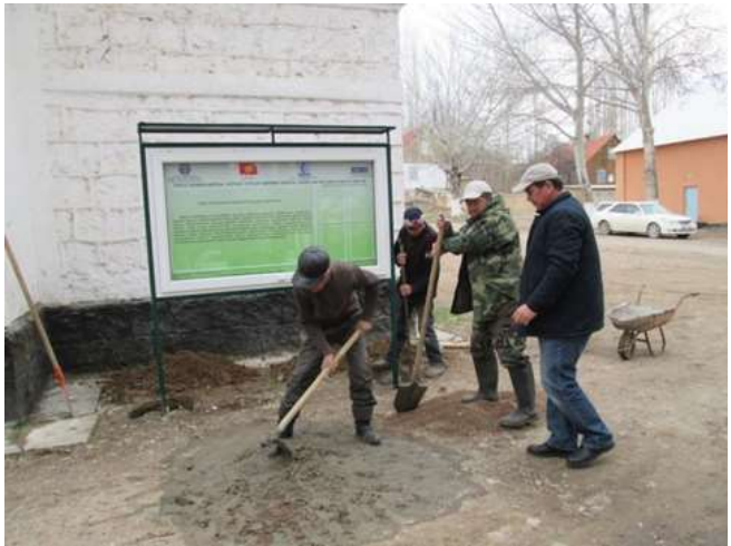
Activity 1.4 Organization of trainings and awareness discussions public on environmental issues